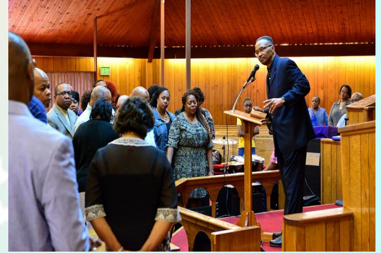
Inaugural Saturday Worship - Orange Drive March 12, 2016