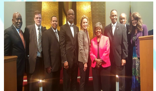
Good Friday Noon Day Service, Church Street CPCA - March 25, 2016